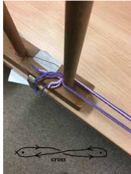
2. Wind on each length with a cross and tie ends together.