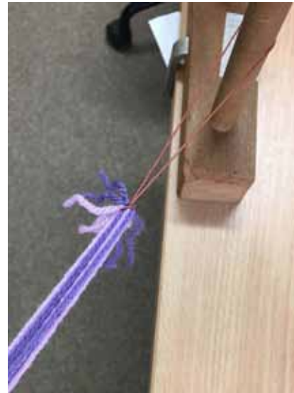
7. Fasten a string loop around the knotted ends with a hitch and attach to a support.

I have used warping posts as that made it easy to take photos but if you don't have them you will have to improvise — the legs of a chair are one possibility. Wider warps can be made in the same way.