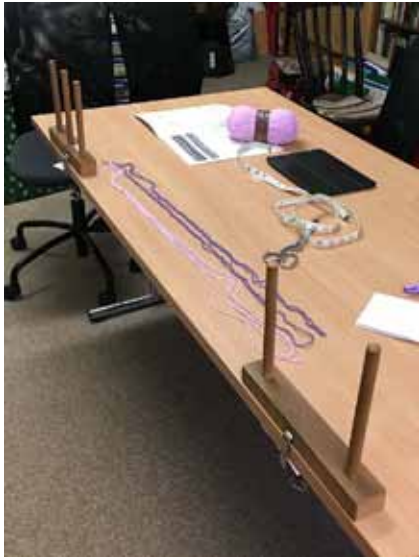
1. Warping posts and 4 lengths of yarn, 2 light and 2 dark