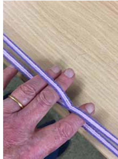
3. The cross with colours arranged with dark yarns on the outside.