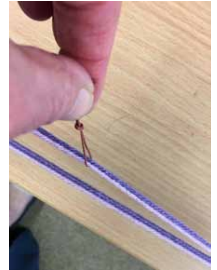
4. Attach a string loop to the upper shed on the left of the cross.